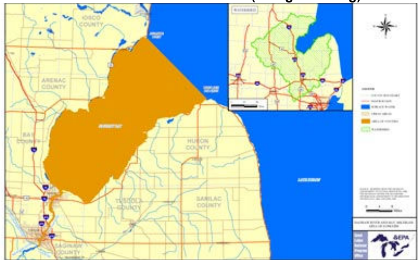
SAGINAW RIVER & BAY AOC (orange shading)